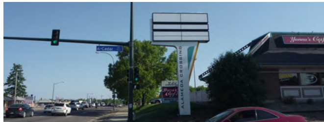
Available Monument Sign Space